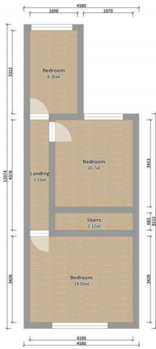
Milner Road First Floor