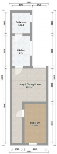
Milner Road Ground Floor